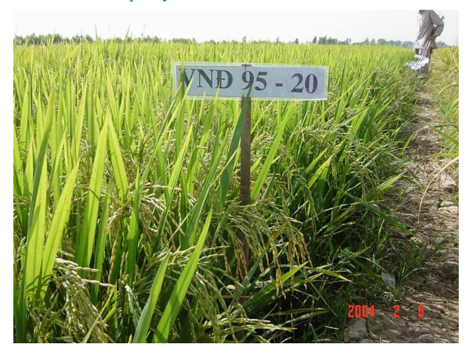
VND95-20, a key variety for rice cropping structure

Tho, Tay Ninh etc. In some locations, VND 95-20 occupied an area of 50.1%, for examples Long An (Nguyen Thi Khoa, 1999). As compared to wild genotype VND95-20 is shorter duration (90-102days), higher yield (4-9ton/ha), better suitability to acid sulphate soil and the same quality as IR64.