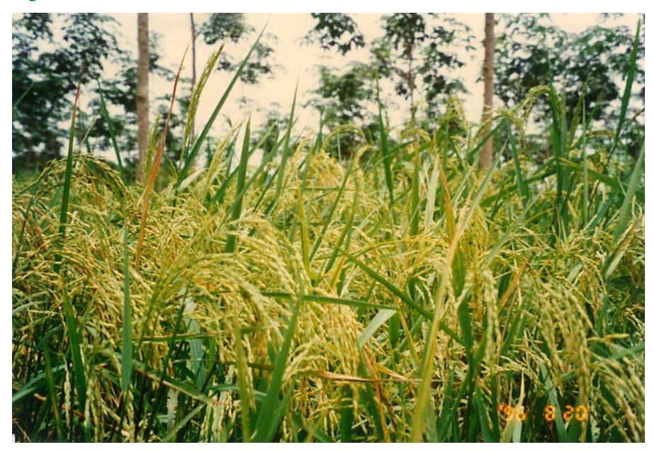
Upland rice variety LC

Vietnam has about 150,000 ha of upland rice, which concentrated in mountainous zones where minority people are living and growing traditional varieties. Local upland rice varieties are low yield (1-1.5 ton/ha), long duration (150-180 days). Previously, IAS released some upland varieties as: LC88-66, LC88-67, LC 90-4, LC 90-5. These varieties were approved as national varieties and cultivated in some mountainous zones in Northern and Southern Vietnam. Recently, new promising varieties as LC 214, LC226, LC 227, LC403 have been released with high yield, tolerant to Bl, good quality suitable to local consumers. These varieties are developing in Central Highlands (Daklak, Gialai) where food shortage has frequently been threatened to people.