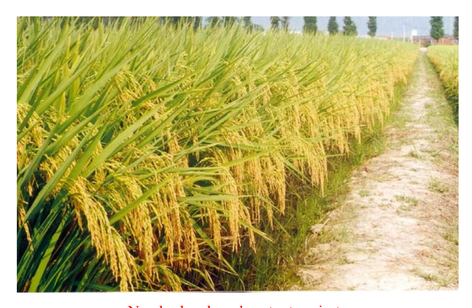
Newly developed mutant varierty

Methods : application of different breeding methods as introduction, hybridization, mutation, pure line selection.